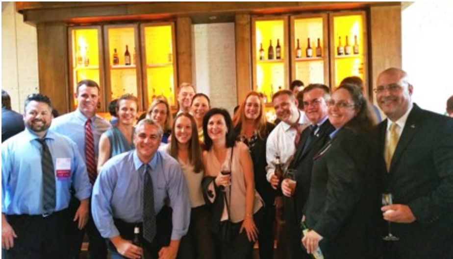
FLORIDA LDAC 2016 CONTINGENCY

The Lobbying Effort on Capitol Hill highlights the meeting. This year, we focused on modernizing the appraisal regulatory structure which was initiated by FIRRE in 1989.